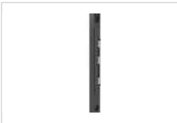
Closure strip for the wicket gate