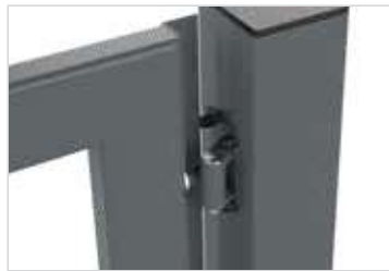
Mounting hinge (close-up)