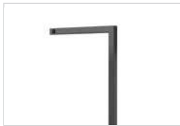
Standard long handrail