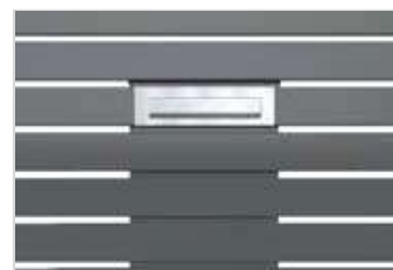
Invisible Post Box