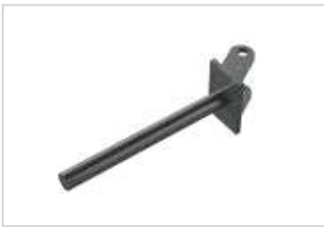
Hinged sheet glued to gates and wicket gates